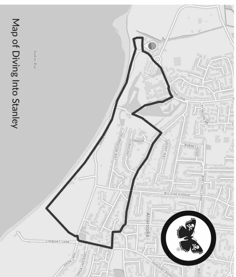
Map of Diving Into Stanley

Turn left along Church Road and then bear left. When you reach the little island, turn right into Village Road.