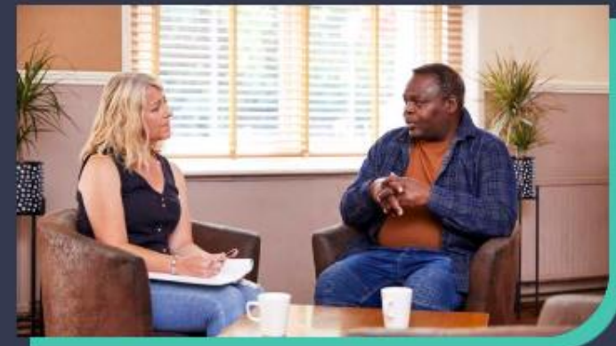
Social prescribing link workers