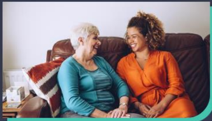
Voluntary and community organisations

Whether you're a health professional or link worker, involved with a voluntary organisation, or here to find help for yourself or a loved one, we've advice and information that can help.